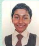
NAINIHA.A.S C-2801, IV