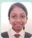
KOMAHAL.S C-2719, V-A