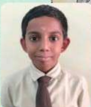
AMRIT.A C-2513, VII-B