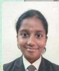
NISHAA.B.U C-2802, VI-A