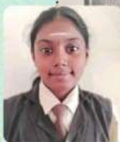
ALARKKA.K C-2758, VIII- C