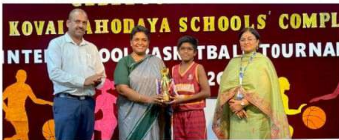
Kovai Sahodaya Schools Complex Basketball Tournament -2025