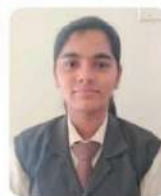
YUKASHINI.T.S C-2736, X-C