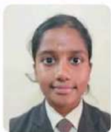
NISHAA.B U C-2802, VI-A