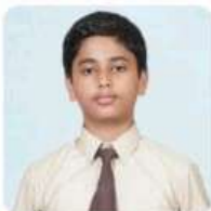
MUHIL.N C-2587, IX-D