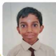
AMRIT.A C-2513, VII-B